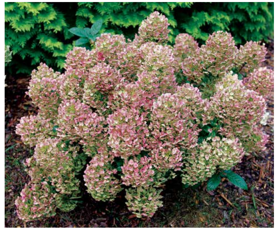
One hydrangea that has been sized down to fit smaller landscapes more creatively is Tiny Quick Fire* Panicle Hydrangea (Hydrangea paniculata 'SMHPLQF' PP25136) grows 18 inches to 3 feet high and 2–3 feet wide.

Georgia Clay, plant selections manager at multistate grower Monrovia Nursery (based in California with other farms in Oregon, Georgia and Connecticut), collaborates with breeders in new plant