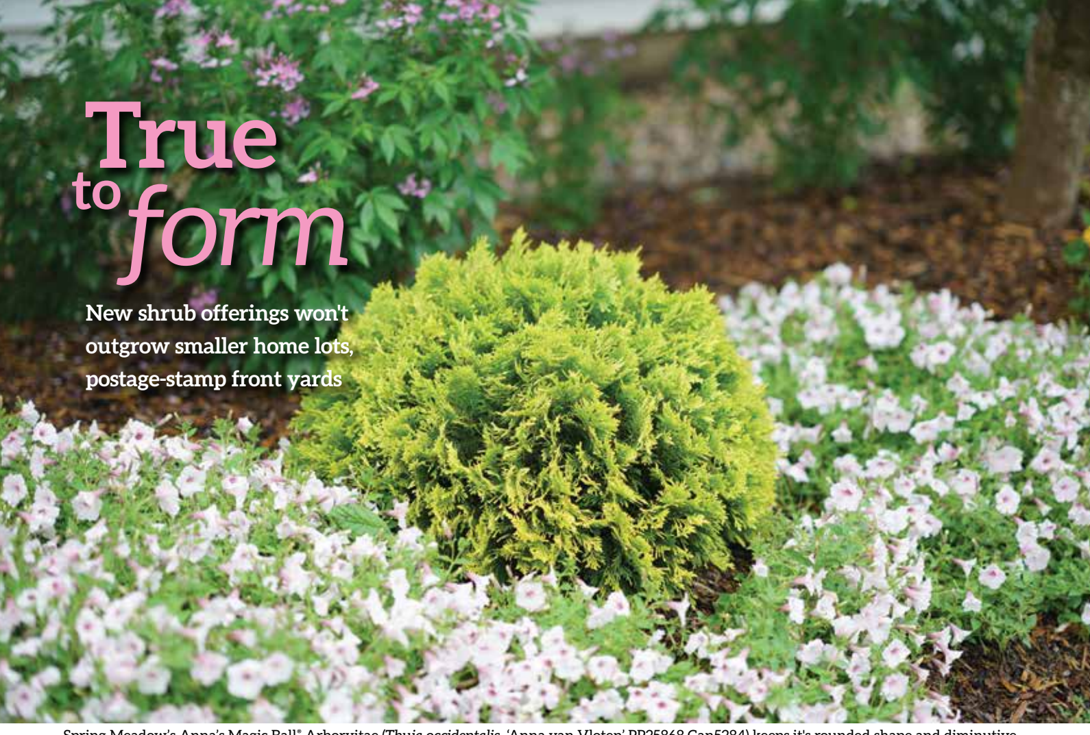
Spring Meadow's Anna's Magic Ball* Arborvitae (Thuja occidentalis 'Anna van Vloten' PP25868 Can5284) keeps it's rounded shape and diminutive size withoug pruning.