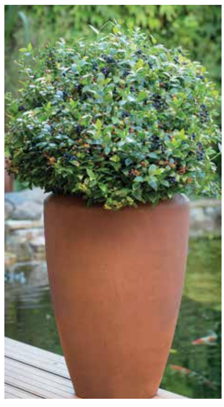
BerryBux® looks like a boxwood, but has the bonus of blueberries. Its boxwood-like foliage and compact habit make it perfect for planting as a hedge or in groups in the garden.

"There are numerous varieties that are evergreen year round, they're easy to maintain, self pollinating and fruiting," Staddon said. "There are beautiful colored leaves on smaller varieties and small com-