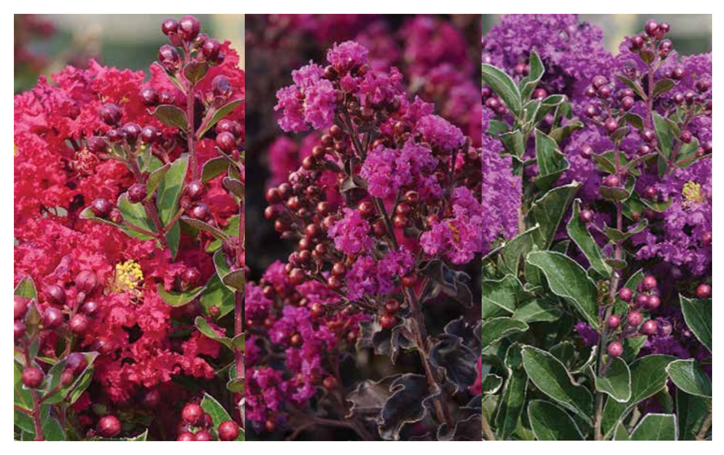
Monrovia's Summerlasting™ Crape Myrtles ( Lagerstroemia indica ) are bred to be compact shrubs without any pruning and come in three varieties: Strawberry (L.i. 'HOCH266' PP34124), Raspberry (L.i. 'HOCH631' PP33208), and Plum (L.i. '1605' PPAF).

'Fire Power', which Nordstrom said is useful for color in a front garden for size. She said the Cavatine Pieris ( Pieris japonica 'Cavatine') is also a slow grower that gets to 2 by 2 feet in 10 years and works well to plant under a window because it won't be blocked over time.