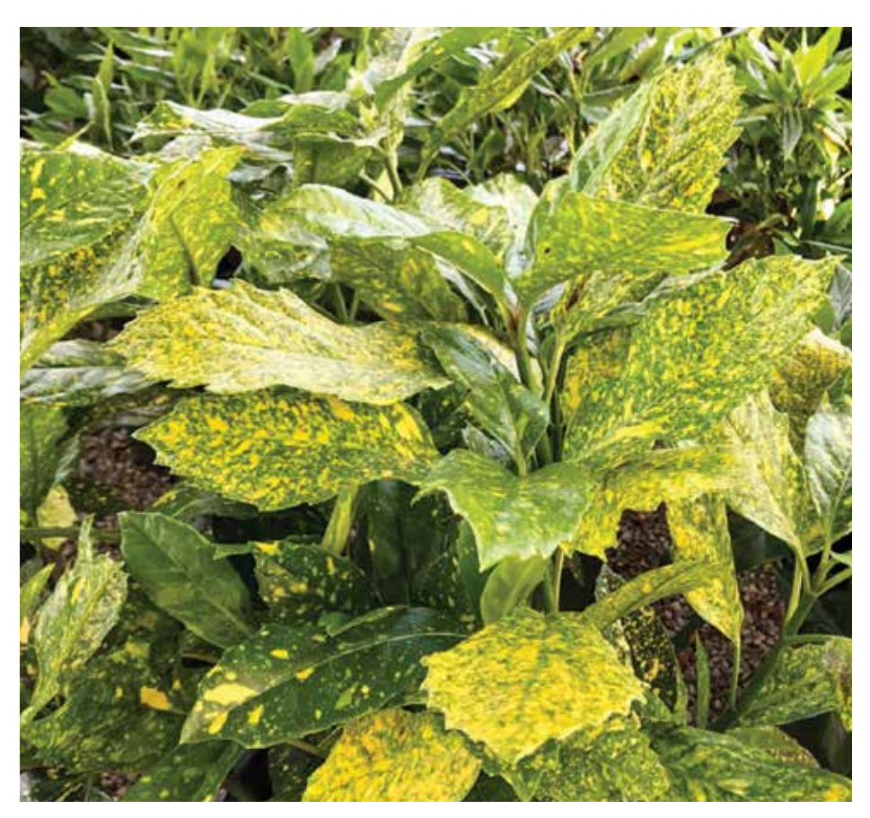
Japanese laural variety Mr. Goldstrike (A. j. 'Mr. Goldstrike') is compact with emerald green and gold variegation.

"It's zone five to nine in full sun to shade, so it's super adaptable and in different areas and very rounded," Carmolli said. "One thing that makes it different is that its flower spikes stick straight up on the plant like exclamation points.