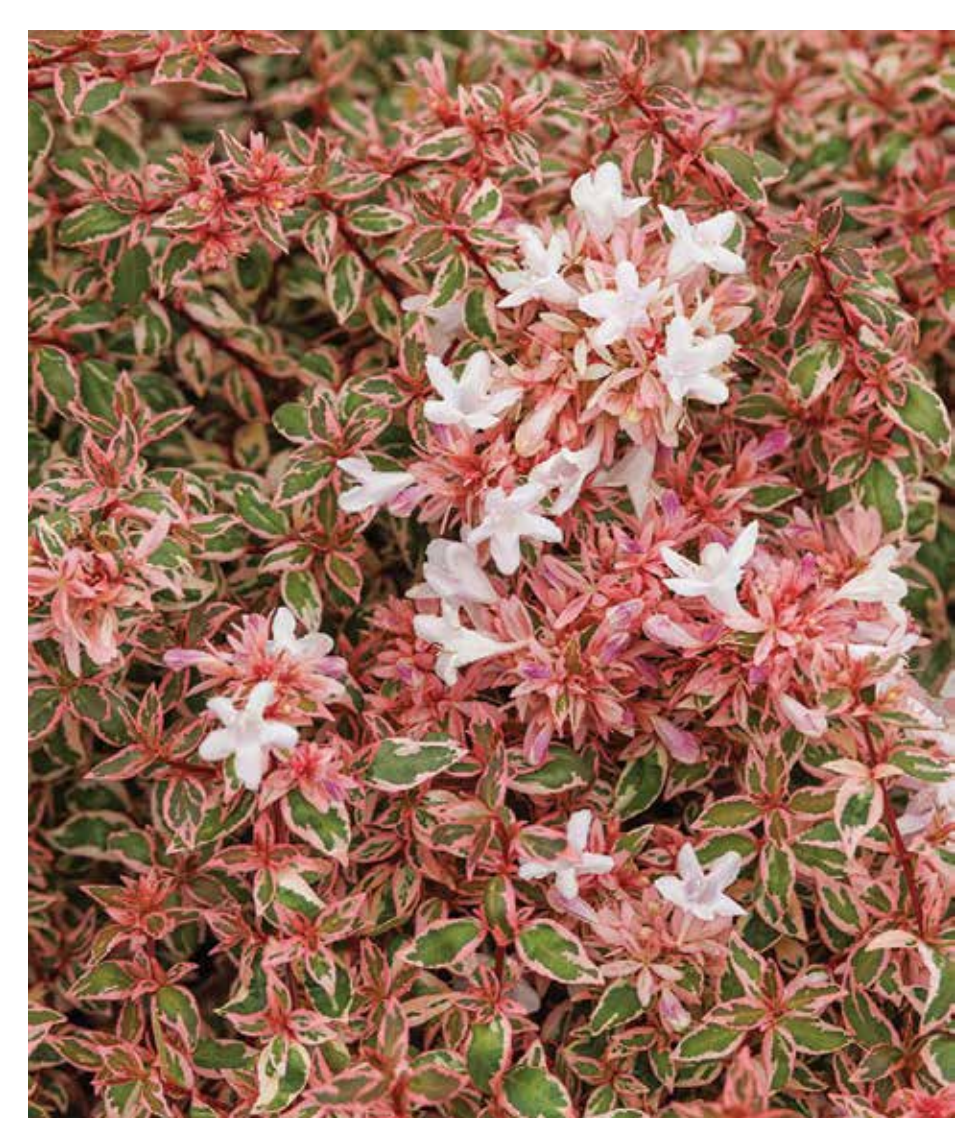
Angel's Blush* Abelia (Abelia × grandiflora 'ABL-PII' PPAF) grows 2 feet tall by 3 feet wide and has small green and white variegated leaves that take on a rose-pink hue in cold weather and its white summer blooms are loved by hummingbirds.

pact berries that are terrific for birds."