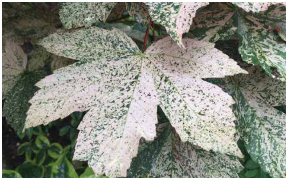
Acer pseudoplatanus ‘Esk Sunset’ has variegated white, pink and green leaves, with more prominent pink tones on the underside.