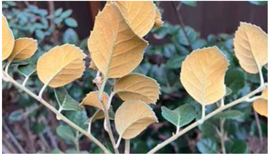
Golden oak gets its name from the color of the underside of the leaves.

Sometimes when we hear people talk about plants and make certain statements about them, we begin to believe them, especially when we hear other plant people espouse the same "facts." For many